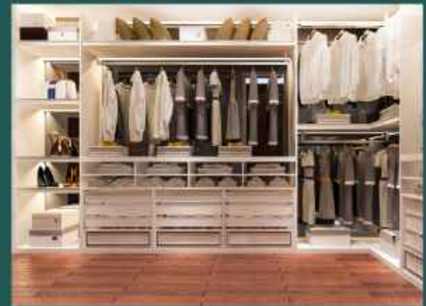
WARDROBE IN ONE BEDROOM

*All visuals including images and blueprints serve as provisional reference points. Final output may vary.