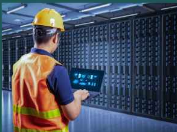
POWER BACK UP