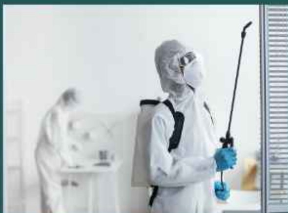
ANTI TERMITE TREATMENT