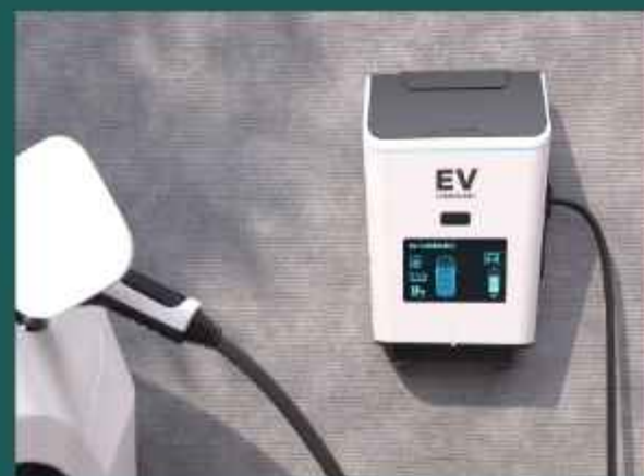
ELECTRIC CAR CHARGING POINT