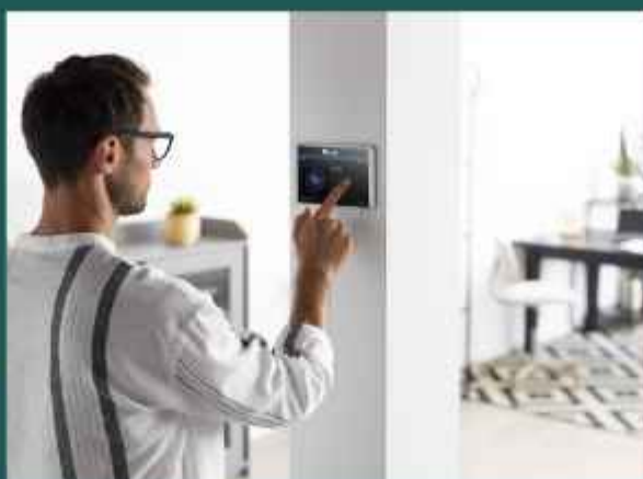
SMART HOME AUTOMATION