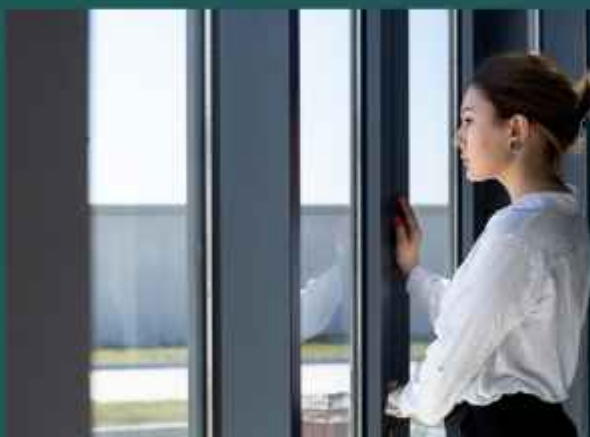
UPVC DOORS & WINDOWS