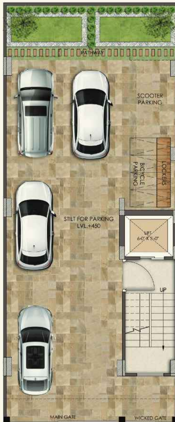
STILT FLOOR PLAN

A layout representing the parking design, meant to safely accommodate four as well as two wheelers.