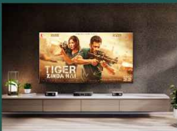
TV PANEL IN DRAWING ROOM