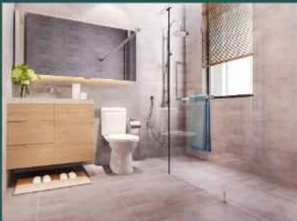
PREMIUM BATHROOM FITTING